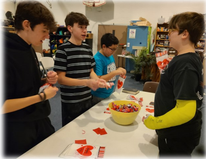
The Pathfinder club meets every other Wednesday from 6:30 pm- 8pm at MVCS.

The Williamsport Club also recently made Valentine's day goodie bags for the residents of Fulmer's Personal Care Home.